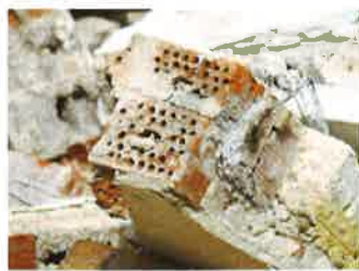
Increasing C&D Diversion