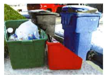
Long-term Visioning for Residential Recycling

We are asking You to participate in this process by: