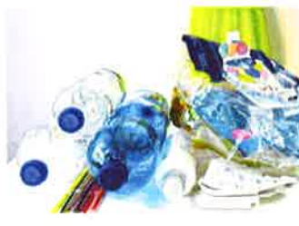
Standardizing Commodities & Messaging