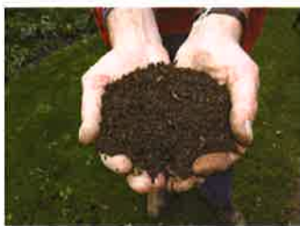
Increasing Organics Diversion

Phase II will be an engagement of regional constituents to formulate priorities and future plans for opportunities such as: